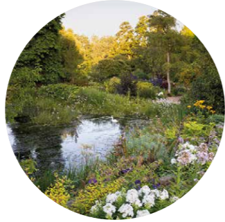
FULLERS MILL Bury St Edmunds