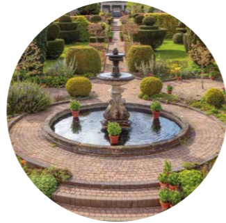
2,339 THE LASKETT Herefordshire