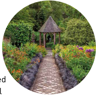
23,321 YORK GATE nr Leeds

37,000+ visitors enjoyed our gardens that have been gifted to us by special supporters.